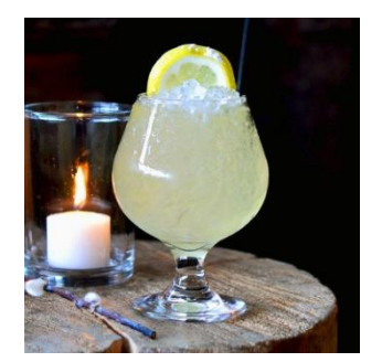
Gold medal 2018

The GIN Masters Contemporary Tastings.com, 2018 World Gin Awards, 2019